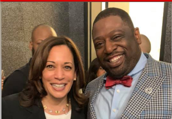
PRESIDENTIAL CANDIDATE KAMALA HARRIS