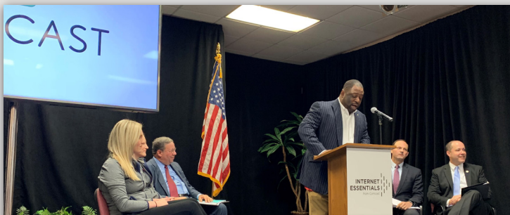
COMCAST INTERNET ESSENTIALS