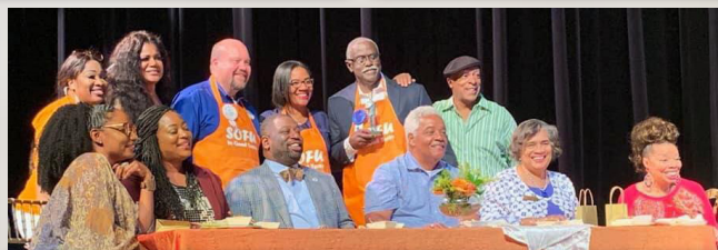
TASTE OF SOUTH FULTON