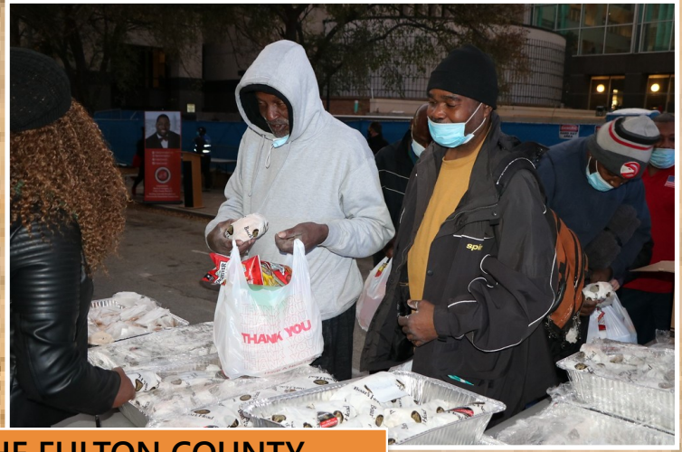
PRYOR ST IN FRONT OF THE FULTON COUNTY GOVERNEMENT CENTER