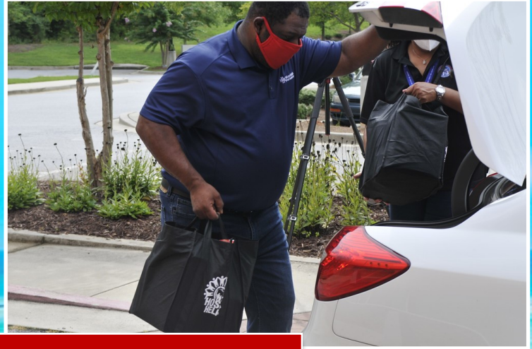
ArtsXchange · Wolf Creek Library · Oak Hill